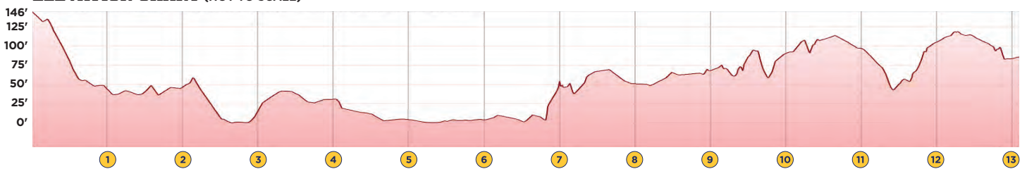
ELEVATION CHART (NOT TO SCALE)